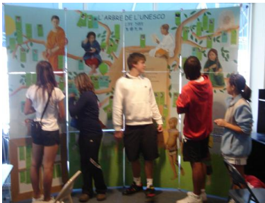
Workshop participants examine a UNESCO exhibit at the tennis event.

The World Class Tennis Tour 14U (14 years and under), a tour that promotes the importance of fair play, respect, integrity, and solidarity among young players, held its first Junior Ambassadors Tennis Cup , 1-4 November, at the William H. G. Fitzgerald Tennis Center in Washington, D.C. In addition to tournament play in which athletes from eight countries competed in singles and doubles,