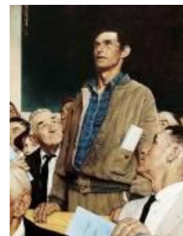
Once of iconic posted in the exhibit. (Source: “Freedom of Speech”, Norman Rockwell)