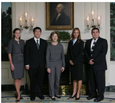
Mrs. Laura Bush congratulates four of the U.S. National Commission for UNESCO Laura W. Bush Traveling Fellows.

Mrs. Bush hosted the first recipients of the U.S. National Commission for UNESCO Laura W. Bush Traveling Fellowship at the White House on October 21, 2008. Four of the five fellows awarded during its inaugural year had the opportunity to explain their projects; the fifth fellow was on conducting her work in India at the time. The privately funded fellowships enabled these university students to conduct brief work abroad within the mandate of UNESCO that helped to bridge nations, enlarge freedoms, and promote democracy. The following are the list of fellow from Summer 2008 and Fall/Winter 2008, including their project titles and location of travel: