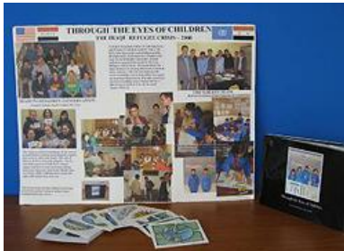
The winning display from the Conserve School team.

Fifty schools from thirty-six countries were selected as finalists by the UNESCO-Daimler Joint Committee and invited to Beijing to meet their partnered teams and present their projects in an exhibition. The Lebanon-Serbia team received the First Prize for their design of a playground for special needs children and the Indonesia-Ukraine team received the Second Prize for their idea of a mobile bike library. The Third Prize was shared by the Syria-USA team and the Germany-Mexico team.