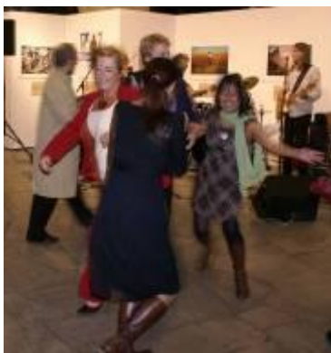
Attendees square-dance during the Dixieland Band performance.