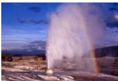
A view of Yellowstone Park’s Old Faithful.

To commemorate the inscription of Yellowstone and Mesa Verde National Parks as the first U.S. sites on UNESCO’s World Heritage List (1978), the Department of the Interior, the National Park Service, and the National Geographic Society organized a photo exhibit celebrating the thirty year anniversary.