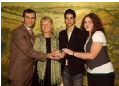
The U.S. and Syria team pose after the awards ceremony.

The Third International Symposium of the Mondialogo School Contest was held in Beijing this year (25 – 28 September) where a team from the United States, partnered with a team from Syria, took third place . Two other American schools were among the twenty-five finalists teams. The contest, created through the joint effort of UNESCO and Daimler, pairs teams together