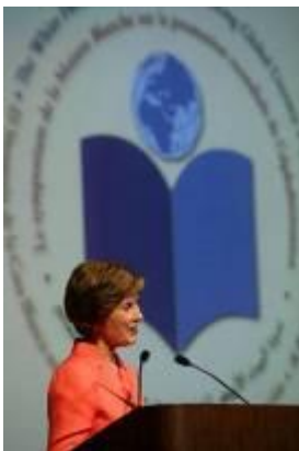
Mrs. Laura Bush delivers remarks at the White House Symposium on Advancing Global Literacy.

The White House Symposium on Advancing Global Literacy was held 22 September at the Metropolitan Museum of Art in New York. The symposium, entitled Building a Foundation for Freedom , served as a follow up to the White House Conference on Advancing Global Literacy held in 2006 and highlighted the ways in which literacy builds a strong foundation for freedom.