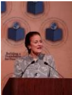
Henrietta Fore elaborates on the contributions made by USAID to advance literacy abroad.

conferences and to reaffirm international commitments.