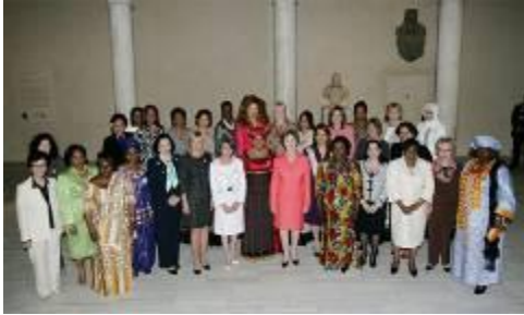
Thirty-six other First Lady's join Mrs. Bush at the Symposium.

contributor to this new fund with a commitment of over $2 million .