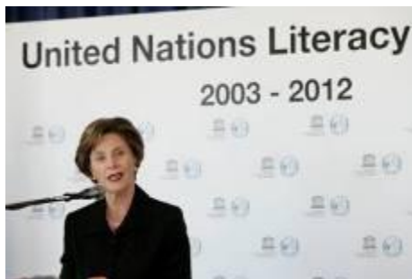
Mrs. Laura Bush addresses the United Nations Literacy Decade Mid-Decade Review Report group at the United Nations in New York City, Oct. 7, 2009.

Two weeks after hosting the White House Symposium on Advancing Global Literacy , First Lady Laura Bush spoke at UNESCO's mid-Decade Review of the United Nations Literacy Decade (UNLD), 7 October. In her address , Mrs. Bush highlighted the actions that UNESCO, its programs, and its member states have taken over the last five years to achieve the Decade's goals, but stressed that there is still much work to be done. To help in this effort, Mrs. Bush announced an additional U.S. commitment of $500,000 to the UNLD Fund (from the original $2 million announced on 22 September).